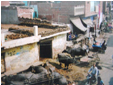
A bird's eye view of Shahid Nagar community

Our Mission is to work amongst the deprived and underprivileged communities by inspiring and motivating those people to realize their potentialities. The organization strives to work for the social and economic development of people by providing whatever practical help they need in the form of information, advice, capacity building, organizing for training and funds.