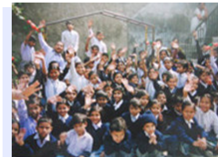
Annual Sports Day : Deenbandhu School

The Secretary, Delhi Brotherhood Society 7 Court Lane, Delhi-110054. INDIA email : mono@del2.vsnl.net.in , dbs@bol.net.in